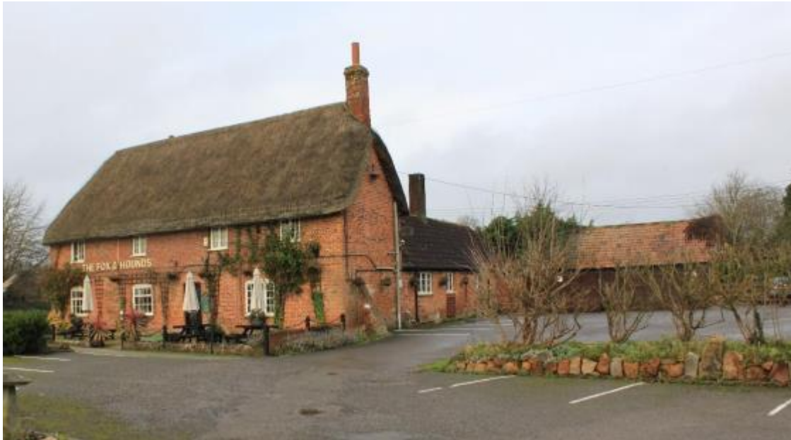
Fox and Hounds