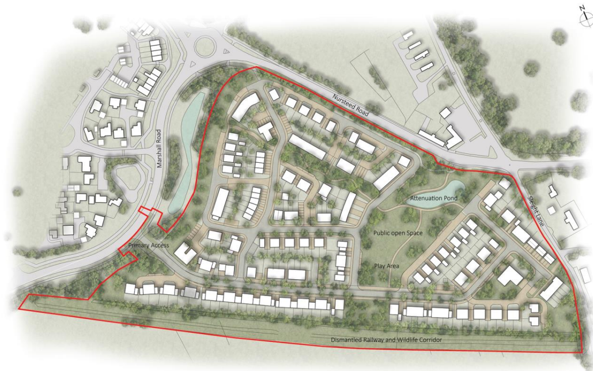
Sketch Master Plan – for indicative purposes only

The precise details of the layout, density, design and appearance are therefore unknown at this stage; however, the application is supported by an indicative layout plan in order to demonstrate how the site could be developed and a series of context plans which demonstrate that a scheme can be developed with sufficient supporting infrastructure.